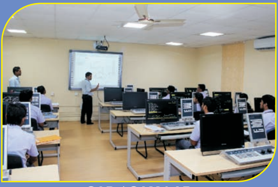
CAD / CAM LAB